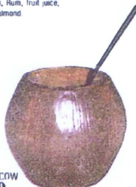
RUM COW 4.50

You don't have to be a pagan to live like one! Cavorting cannibals get their cookouts rolling with this exotic brew, discovered centuries ago by the Island's