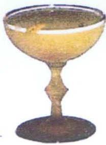
PASSION COCKTAIL 4.50

Rum, passion fruit nectar and lime make this a smooth and refreshing cocktail.