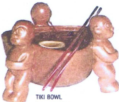
TIKI BOWL for one or two 6.50

A Hawaiian favorite made with a delicious coconut syrup.