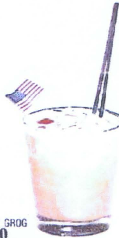
NAVY GROG 4.50

Light separate ingredients blended to make stout-hearted sailors out of the weakest men.