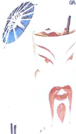
DR. WONG'S TONIC 4.50

The symbol of peace and beauty, blended with Chinese Rose Wine, Perned and tropical fruit juice.