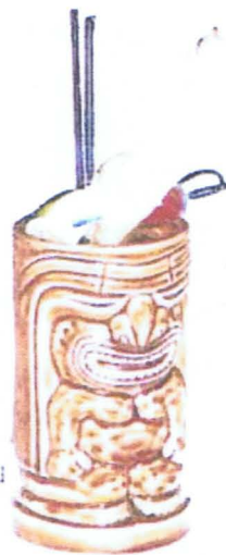
MAI TAI 4.50