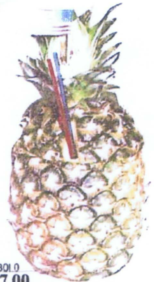
BOLO 7.00 Fresh pineapple filled with fine Rum and tropical fruit juice.

A delightful prescription of Rum, Orange Curacao, passion fruit juice and fruit juice. Island natives believe this Tonic is sure to kill your worries and cure your ills.