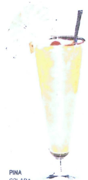
PINA COLADA 4.50

A famous tropical drink, blended with Brandy, Gin, Rum, fruit juice, and a touch of almond.