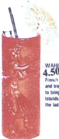
WAHINE'S DELIGHT 4.50

Light separate ingredients blended to make stout-hearted sailors out of the weakest men.