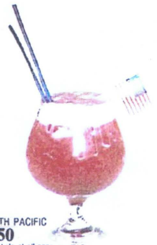
SOUTH PACIFIC 4.50

The island's delicate Coconut Milk blended with Rum, honey and herbs.