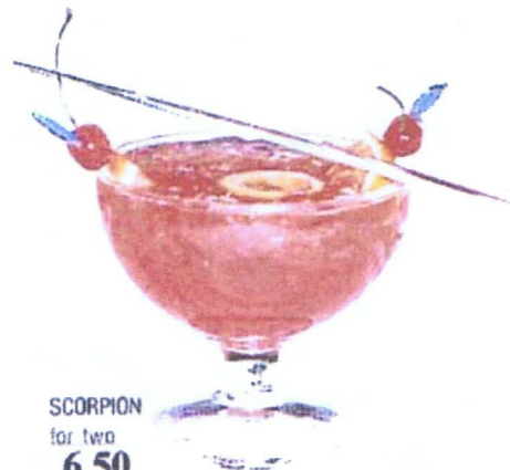
SCORPION for two 6.50

French Brandy, Rum, Perned and tropical fruit juice blended to bring you a breath of the Islands to delight and entice the lady of your choice.